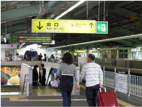
Platform of JR Shin-Kobe Station