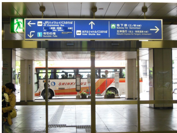
Exit : Go out, turn left and go straight (Photo No.3)