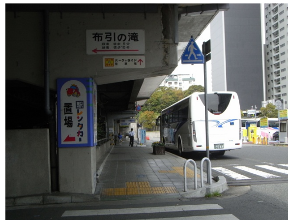
Near the Bus stop (Photo No.4)