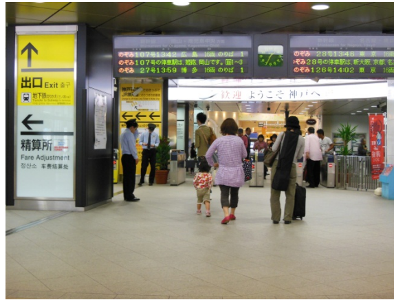
Tickets gate (Photo No.1)