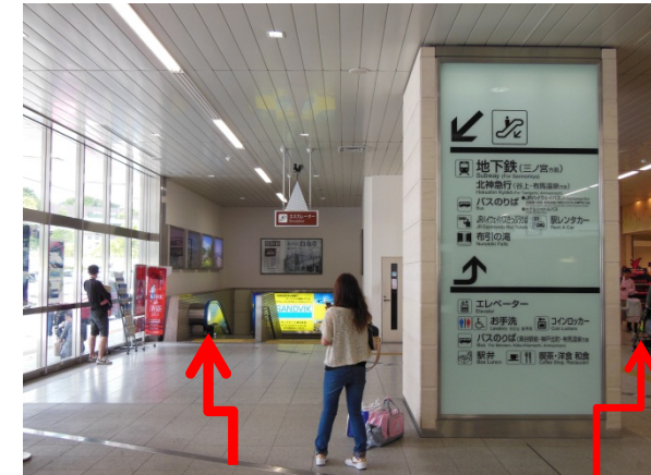
Escalator Elevator 2nd Floor Passage (Photo No.2)