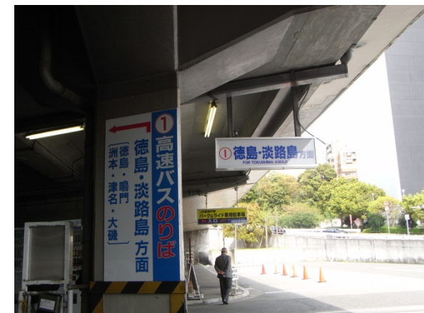
Bus Stop bound for Awaji Yumebutai (Photo No.5)