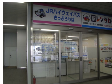
JR Expressway Bus Ticket Vending Machine (1st Floor)